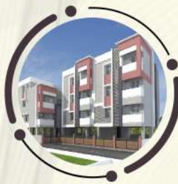
Eesha Plot No: 1020 & 1021, 11th Street, Z Block, Anna Nagar, Ch - 40. Flats starting from 920 - 935 sq.ft