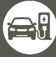
CCP with EV Charging Point