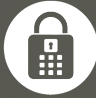
Digital Lock System