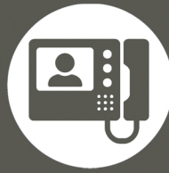
Video Door Intercom