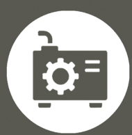
DG Power Backup