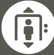
Fully Automatic Lift